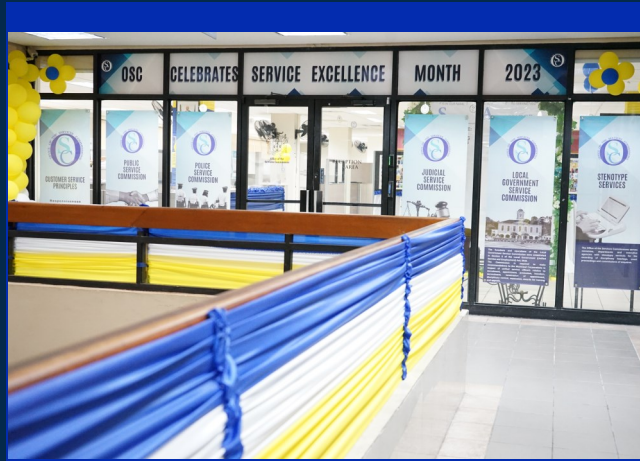
OSC Front Office Decoration