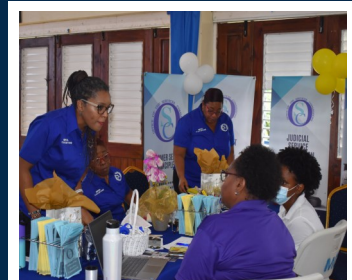
GOJ Mobile Services Fair