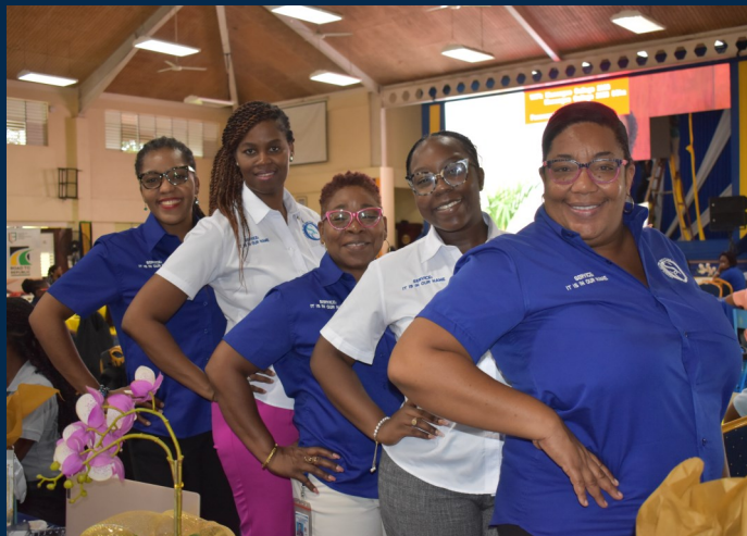
GOJ Mobile Services Fair