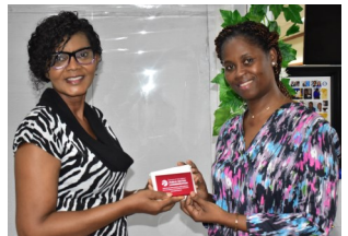
Quiz Competition Giveaways