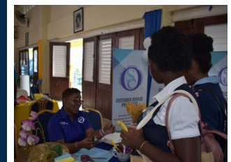
GOJ Mobile Services Fair