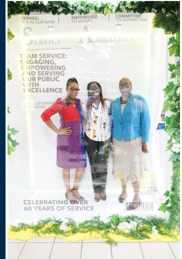
OSC Front Office Decoration