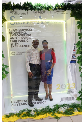
OSC Front Office Decoration