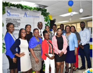
OSC Front Office Decoration