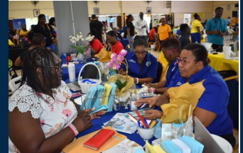
GOJ Mobile Services Fair