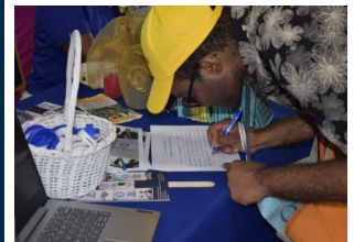
GOJ Mobile Services Fair