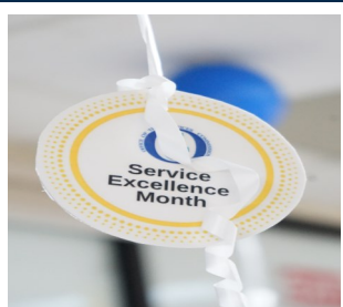
OSC Front Office Decoration